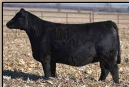
004H DEFIANT DAUGHTER || SELLS AS LOT 105