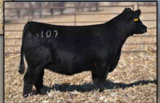
J107 \ \ DAUGHTER OF LOT 7 & SELLS AT LOT 46

F817, lot 7, is the dam to lot 8 and 46, and a full sib to what's in her belly, just an example of what these cows will make. Buy a piece of the T751 legacy before they're gone. Just decide if you want a sister carrying one for a steer or one like lot 46!