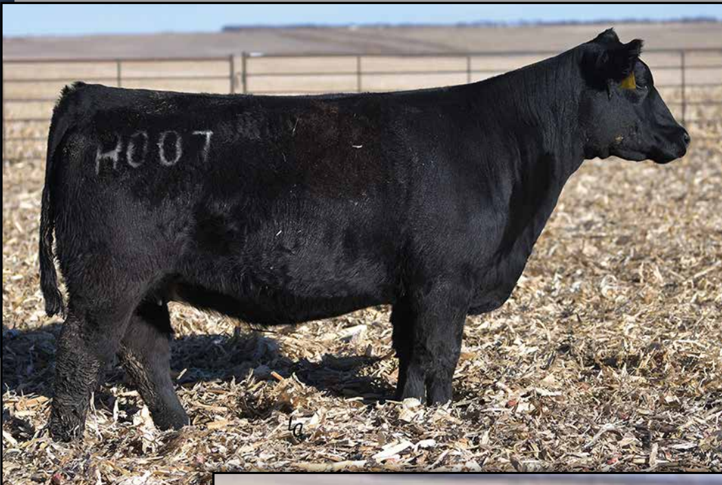
H007 | LOT 32