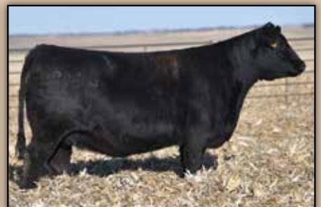
907G DEFIANT DAUGHTER || SELLS AS LOT 108

TUESDAY, DECEMBER 20TH || LIVE ONLINE AUCTION - CCI.LIVE 75