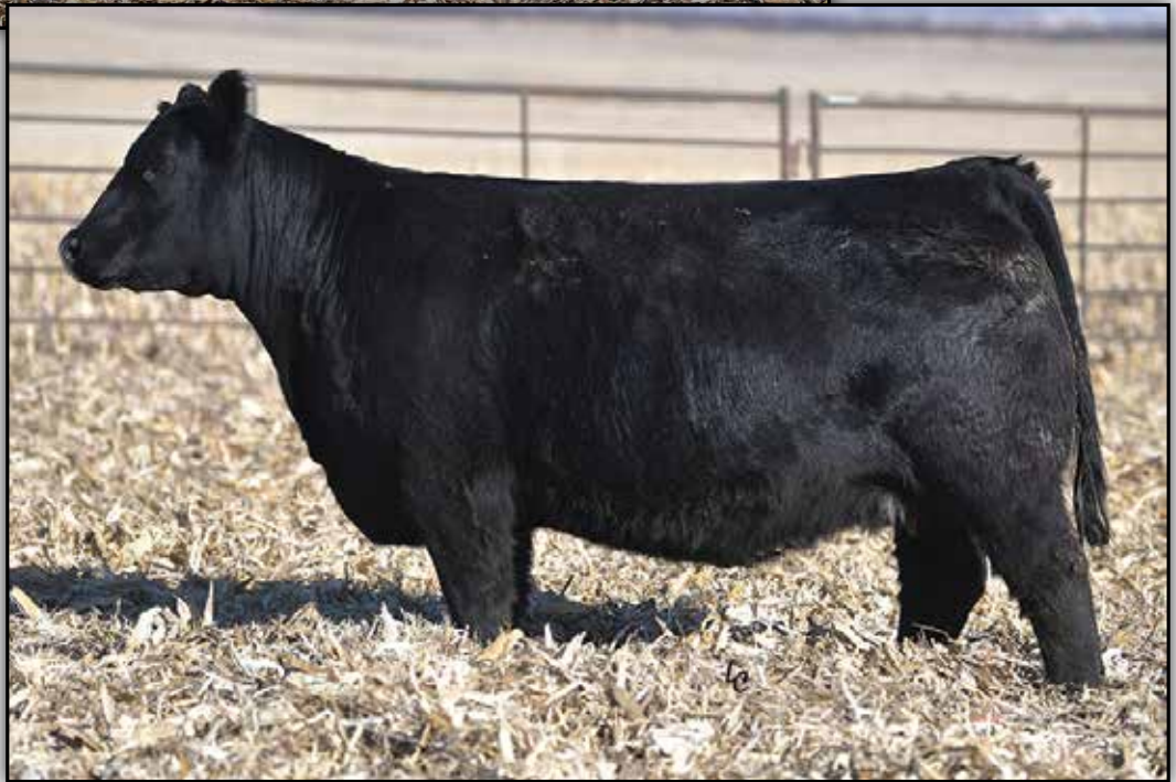
H021 | LOT 33