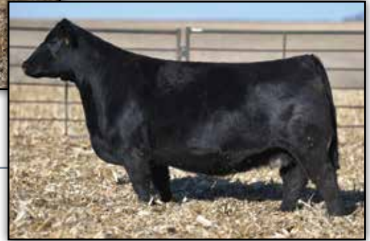
847F \ \ DAM OF LOT 89 & SELLS AS LOT 88

One of the lead off bred heifers, out of one Incredible cow, lot 88. This ones hair and extension is unbelievable, like several Definats in the sale! Making 3/4 Simmentals like this one is exceptionally hard, take advantage as the work is done!