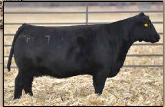
F817 // FULL SIB TO DAM OF LOT 47

DAM F803 (ET) ADRENALINE X T751 DCC LOOKER X 315 JAUER FREIGHTLINER