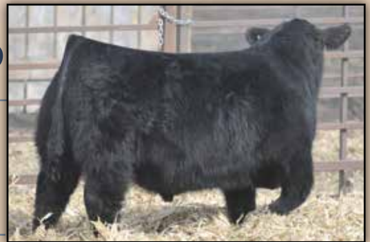
WYATT EARP // PICTURED AS A CALF

DAM A28 500 LINE MOTIVE X W28 MISSING LINK X T28 PADDY O MALLEY