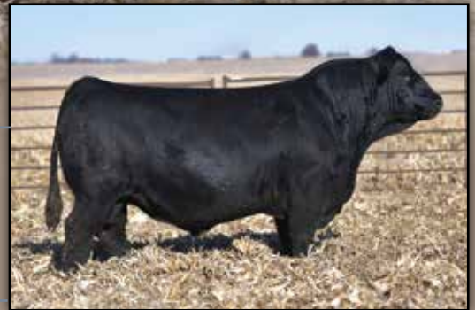
DEFIANT - SIRE OF LOT 13

BREEDING INFO \ \ AI DATE 6/2 - MAY WE ALL \ \ PE DATE 6/4-8/1 - SONNY \ \ LIKELY AI BRED