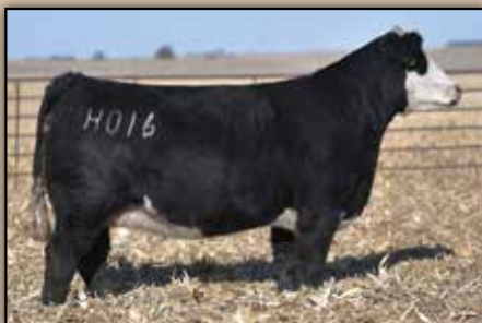
H016 DEFIANT DAUGHTER || SELLS AS LOT 95