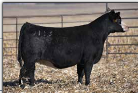
J113 \\ J113 \\ DAUGHTER OF LOT 88 & SELLS AS LOT 89

BREEDING INFO \\ AI DATE 6/29 - HERE I AM \\ PE DATE 7/2-9/1 - WYATT EARP \\ LIKELY AI BRED