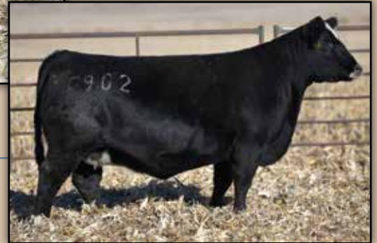
G902 \ \ FULL SIB TO LOT 87 & SELLS AS LOT 86

Solid black full sister to lot 86. Love broodiness of this one. These sisters are out of an impressive Outer Limits dam.